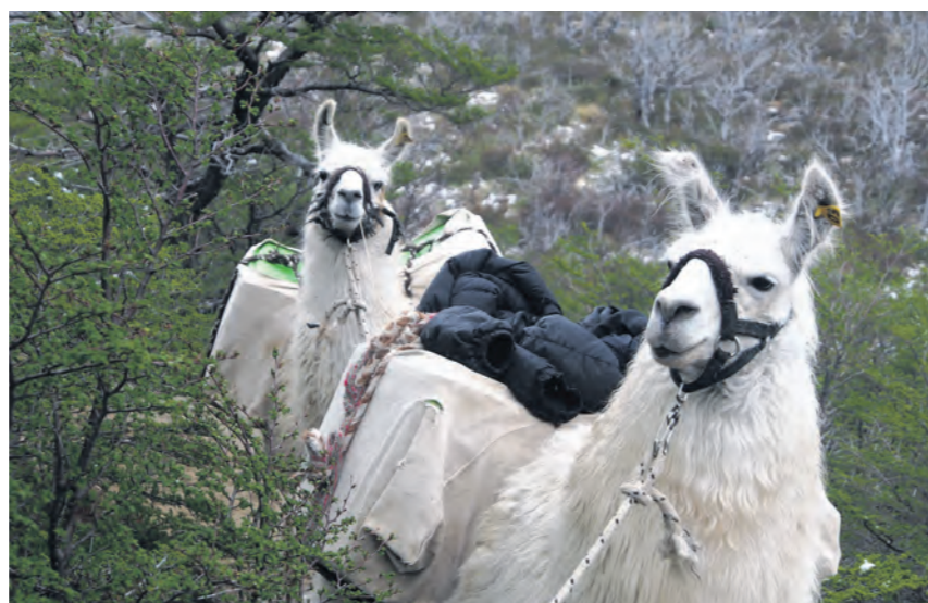
Llamas work as beasts of burden.

behind them. Majestic blue hues contrast with the white — and occasionally dirty-brown — ice, with its jagged pinnacles and ridges.