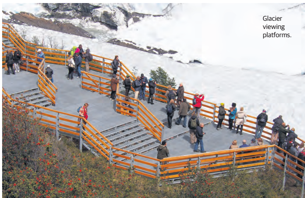
Glacier viewing platforms.

Only after this walk did we join the hundreds of other visitors on the viewing platforms to see both the north and south faces of the glacier, and the more distant glacial flow