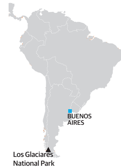
Los Glaciares National Park

I took a path of self-discovery as much as possible, as this is a vast national park, with unexpected discoveries off the main tourist trail. Rather than base myself in El Calafate, close to Perito Moreno Glacier, I spent most of my nights in the village of El Chalten, three hours away by bus. It is a quieter place to stay, friendlier for the independent traveller and has the best access to self-guided walks. And it's a place