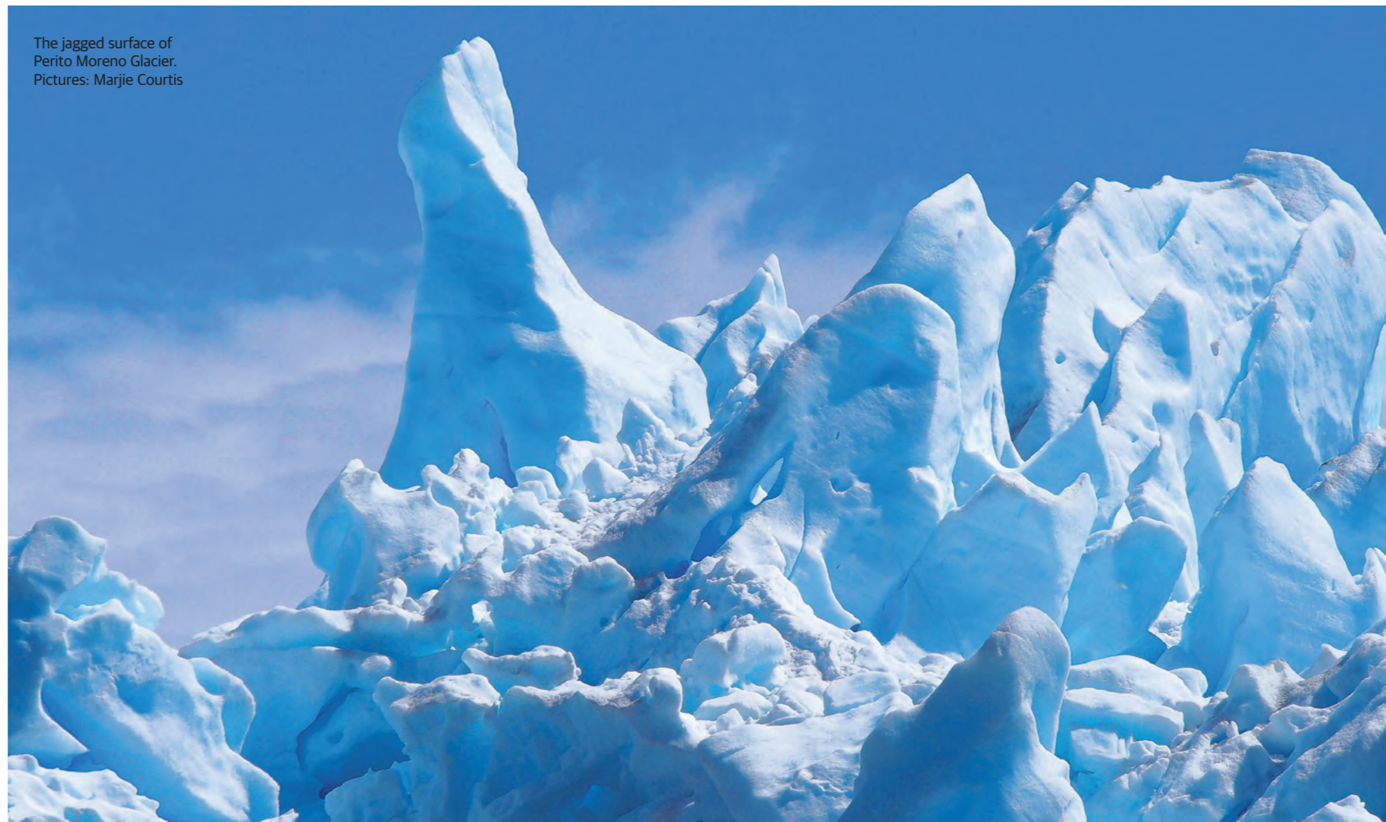
The jagged surface of Perito Moreno Glacier.